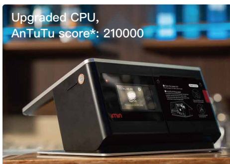
Upgraded CPU, AnTuTu score*: 210000